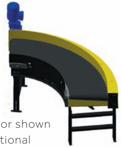
Conveyor shown with optional floor supports.